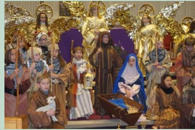
Catholic Schools Week: